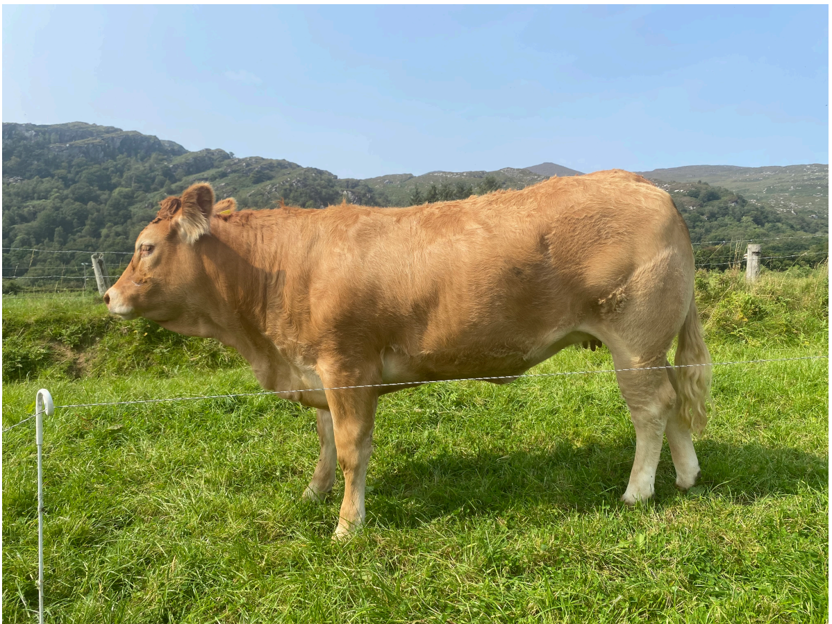
2 Pictures of Lot 10