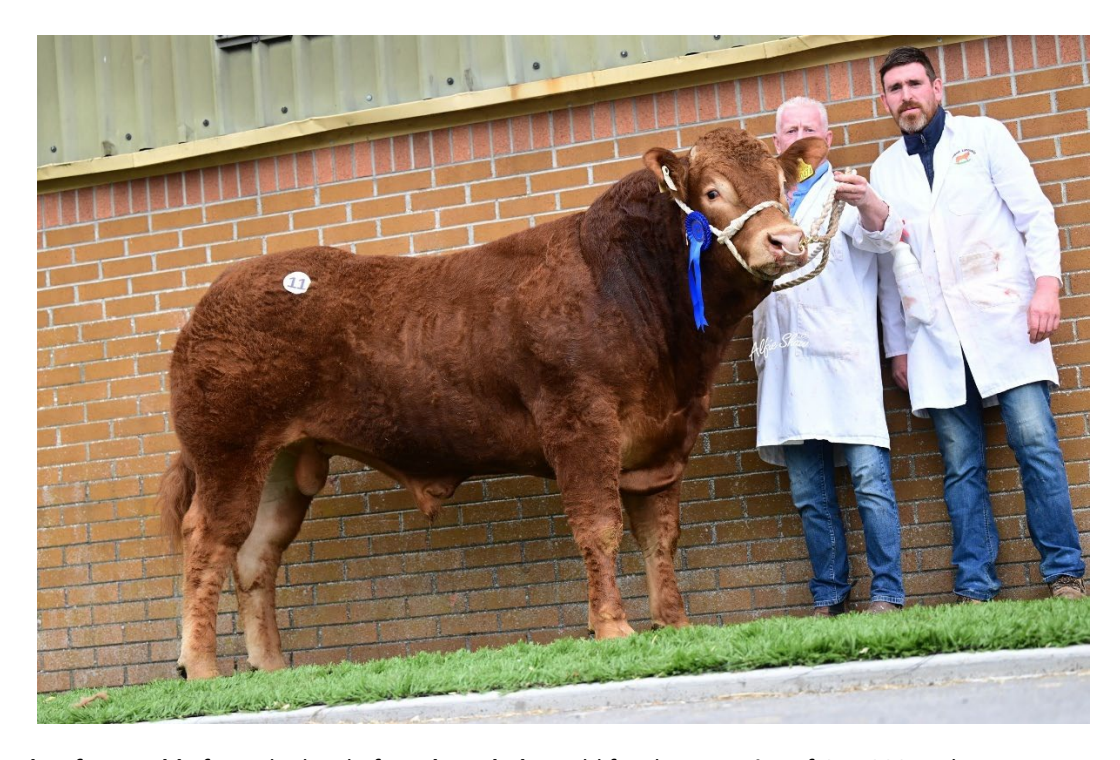
Rutland Unforgettable from the herd of Noel Ruttledge sold for the top price of €11,000 at the May Roscrea sale.