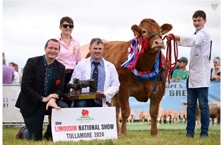
Classes for National Limousin Show