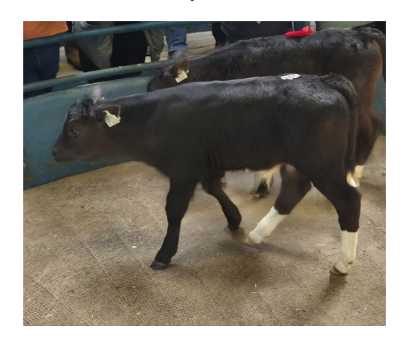
Pair of bull calves - Limousin X Friesian €580 each

The Cork Limousin Club in conjunction with Kanturk Mart held a LMX Calf competition on Tuesday 8<sup>th</sup> Apri. Prizes were on offer to the